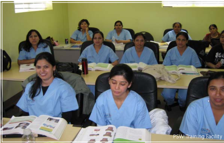
PSW Training Facility