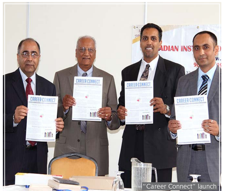
"Career Connect" launch