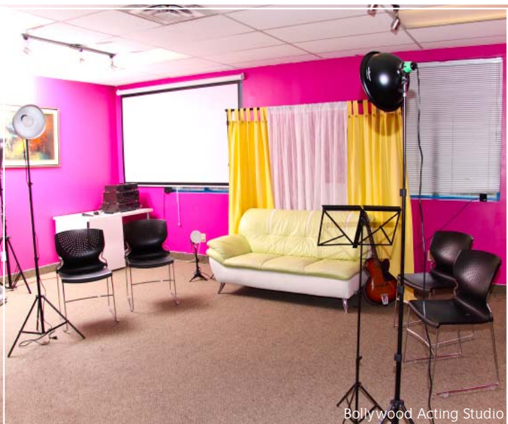
Bollywood Acting Studio